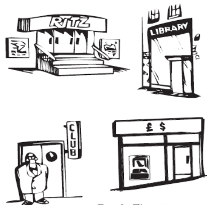
Puzzle Time 2, strona 9